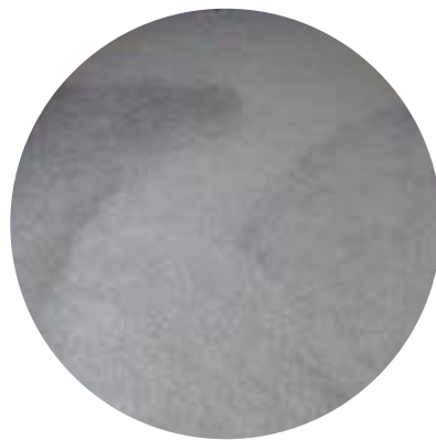
This is what a cut pile carpet can look like if shading occurs

Cut pile carpets, particularly plush pile carpets, may develop lighter or darker patches over time. Known as 'shading', 'puddling' or 'watermarking', it is caused by the permanent bending of the carpet pile fibres which then reflect the light differently. Brushing or shampooing does not reduce shading. The extent to which shading occurs cannot be accurately predicted or prevented. It does not affect the wear or durability of the carpet and is not recognised by Cavalier Bremworth as a manufacturing flaw or defect.